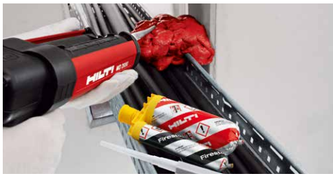
Hilti Firestop Flexible Foam: A reliable firestop seal for all types of cable penetrations, offering quick installation, easy maintenance and retrofitting of cables.