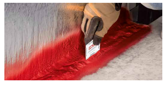
Hilti Firestop Spray: Enables fast and efficient sealing of wide joints, where maximum movement is required – e.g. curtain wall joints or openings between walls and ceilings.